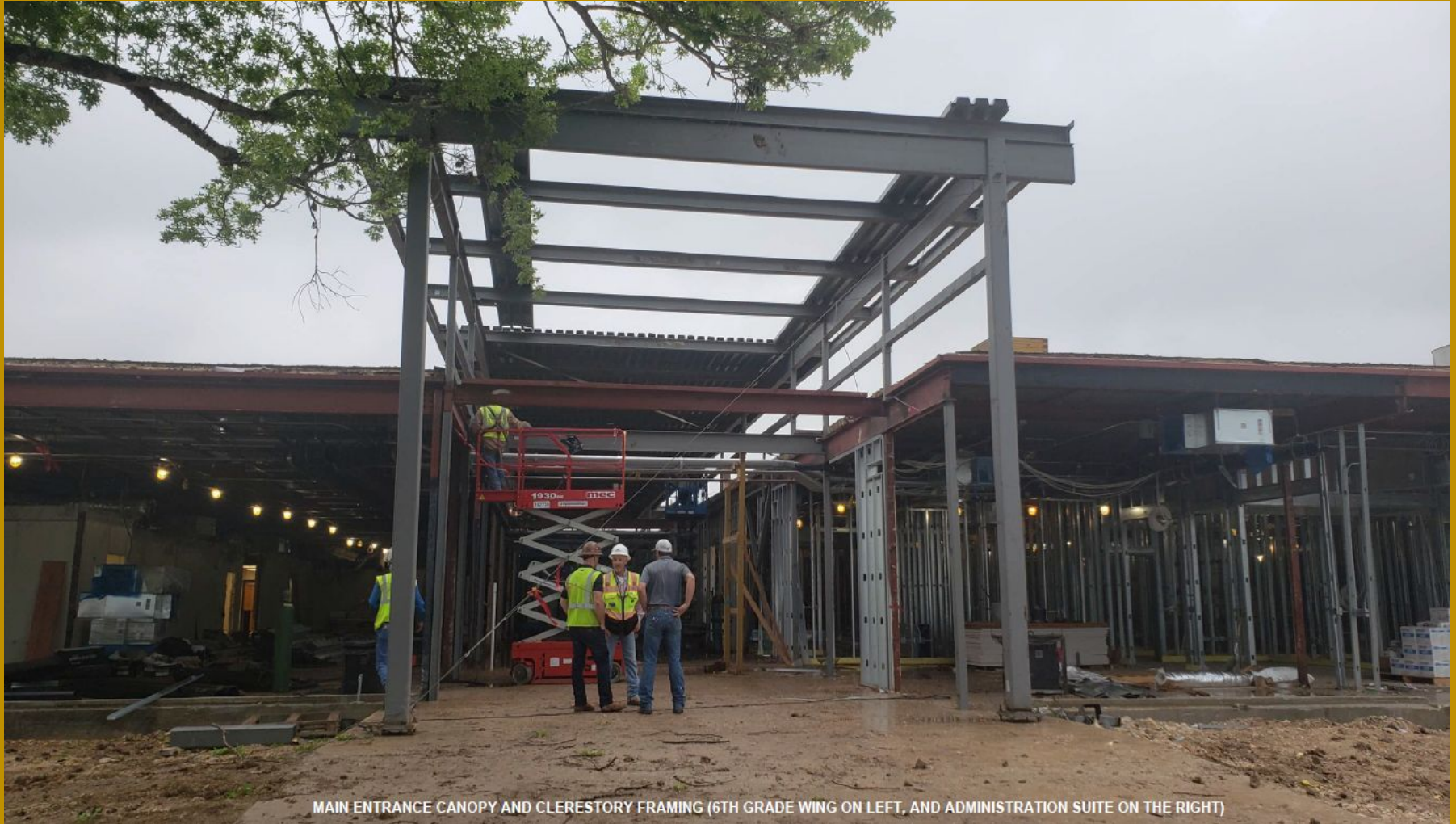
MAIN ENTRANCE CANOPY AND CLERESTORY FRAMING (6TH GRADE WING ON LEFT, AND ADMINISTRATION SUITE ON THE RIGHT)