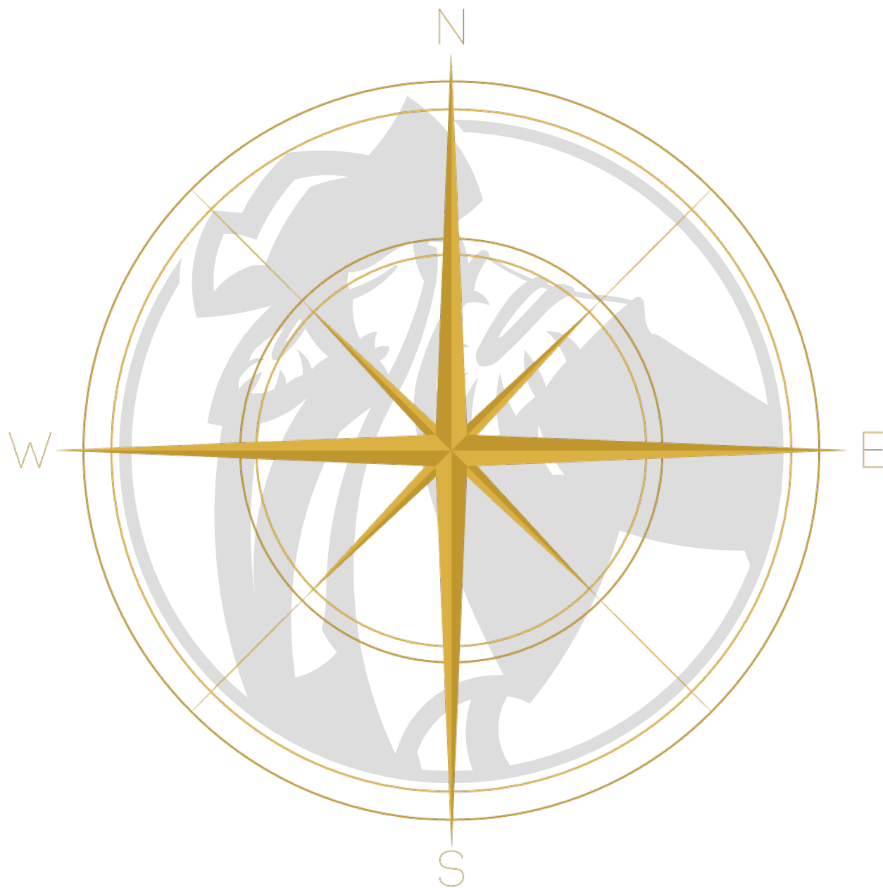
Chart Your Course