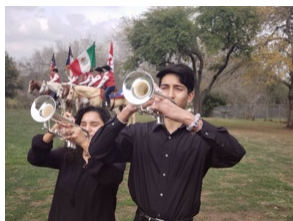
SHS Choir and Band students perform for a Community Texas Independence Day Celebration