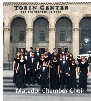
Matador Chamber Choir