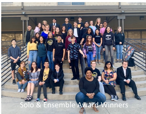
Solo & Ensemble Award Winners

The SHS Matador Chamber Choir recently had the opportunity to sing “O Fortuna” from Carmina Burana with the San Antonio Chamber Choir, YOSA, and seven other area high school choirs for a unique experience at the Tobin Center in San Antonio!