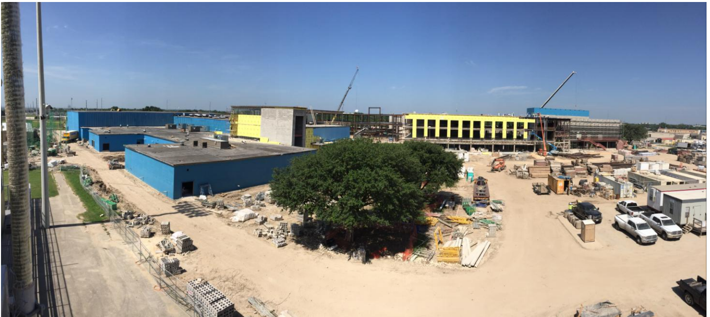
PANORAMIC VIEW – View from the stadium bleachers.

Project Name: New Seguin High School Arch/Engineer: ERO Architects Construction Program Manager: Broaddus & Associates Contractor: Bartlett Cocke/Koehler Current Phase: Construction Administration