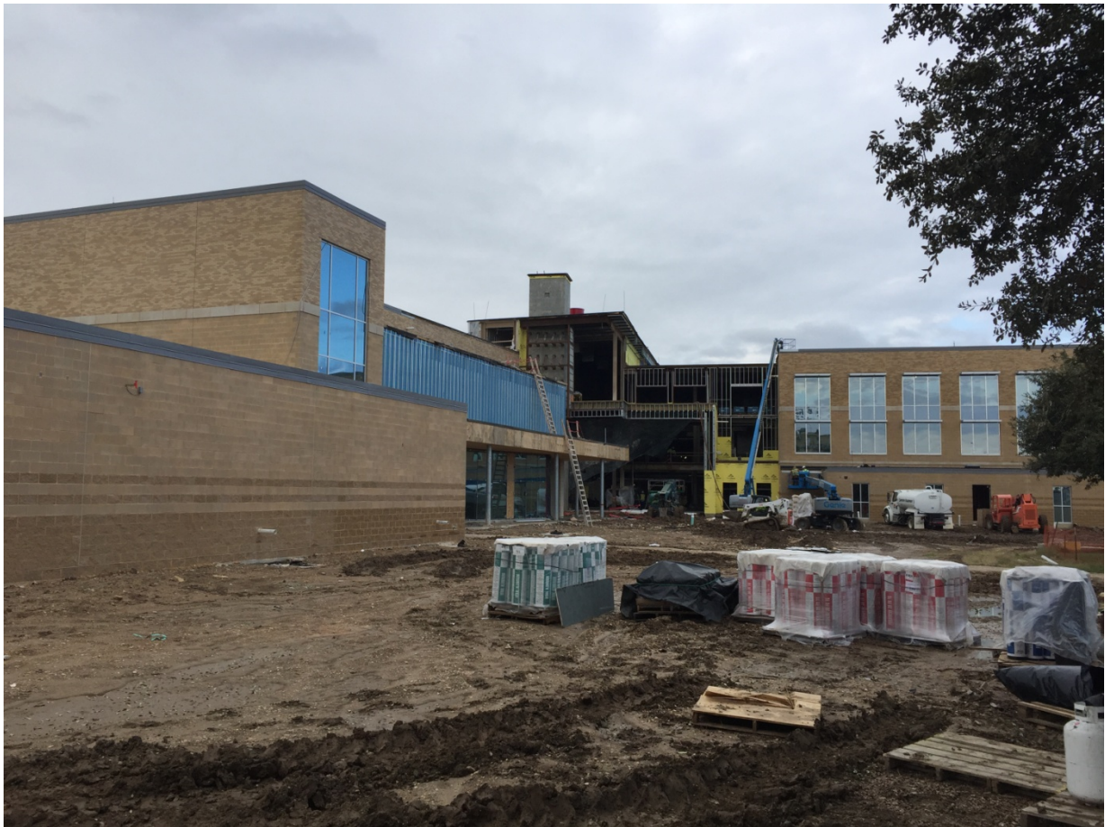
NORTHEAST VIEW OF MAIN ENTRANCE TO SCHOOL On-going miscellaneous work throughout.

Project Name: New Seguin High School Arch/Engineer: ERO Architects Construction Program Manager: Broaddus & Associates Contractor: Bartlett Cocke/Koehler Current Phase: Construction Administration