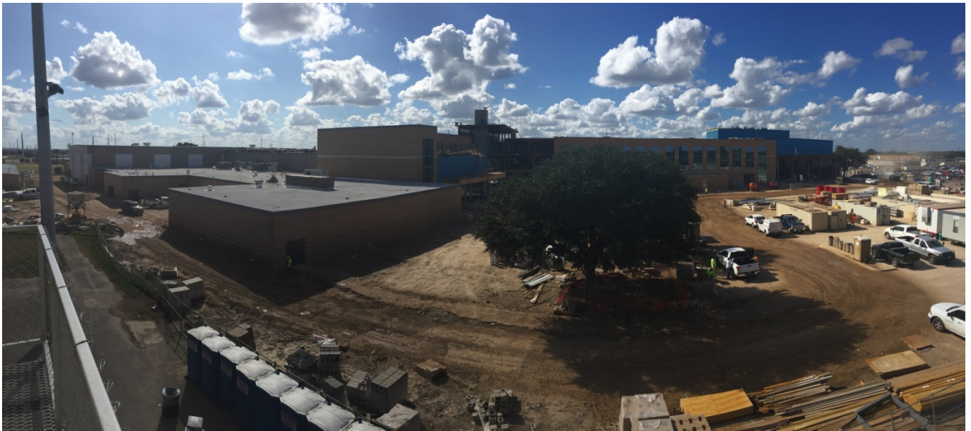
BIRDSEYE VIEW OF PROJECT SITE FROM PRESS BOX On-going miscellaneous work throughout.

Project Name: New Seguin High School Arch/Engineer: ERO Architects Construction Program Manager: Broaddus & Associates Contractor: Bartlett Cocke/Koehler Current Phase: Construction Administration