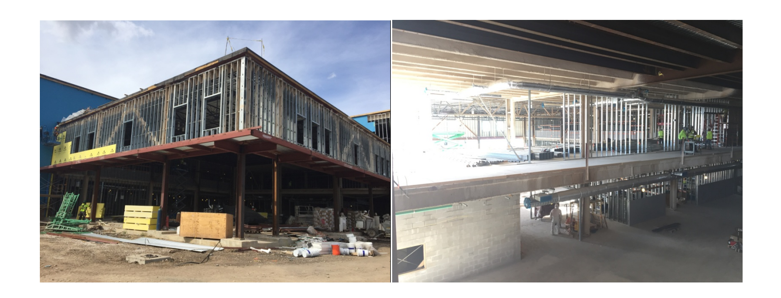
LIBRARY – Light gauge metal studs framing of exterior walls in progress (left photo). Drywall framing of support spaces, adjacent to main atrium. (Right photo).

Contractor: Bartlett Cocke/Koehler Current Phase: Construction Administration