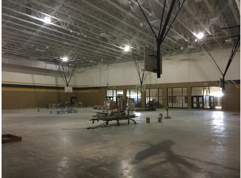
INTERIOR – Taping and floating of drywall in LGI area (left photo). Applying wall accent paint at competition gym, in area HS (right photo).