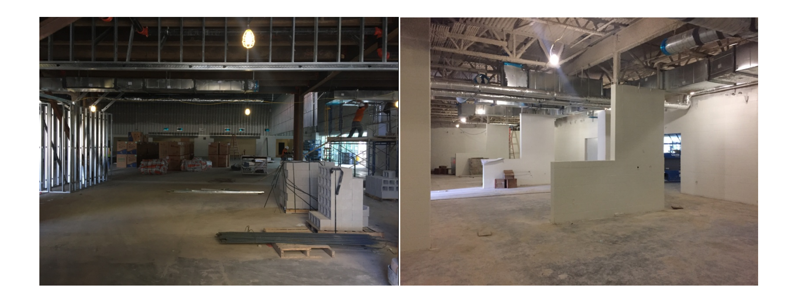
CAFETERIA – Drywall and fur-outs in progress in dining area (left photo). On-going painting of block walls, in kitchen area. (Right photo).

Contractor: Bartlett Cocke/Koehler Current Phase: Construction Administration