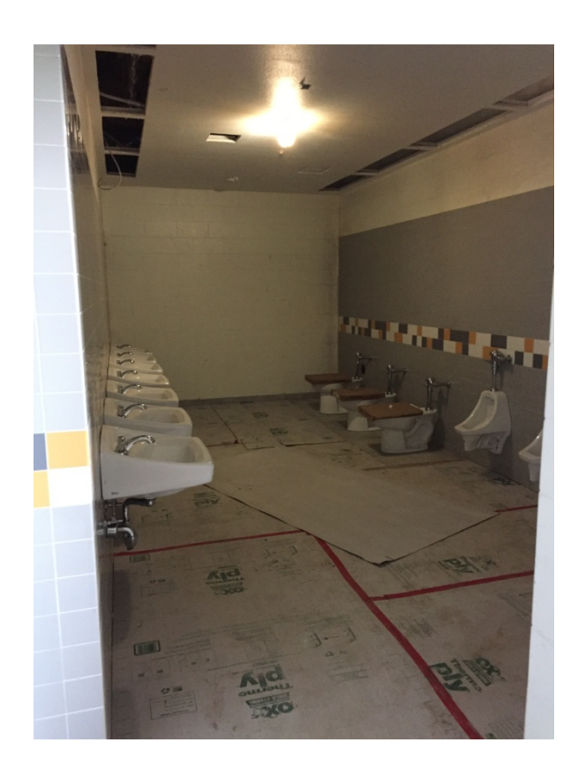
INTERIOR – Tile wainscot at north corridor of area HN (Athletics) (left photo). Plumbing fixtures set in place in areas HS & HN (Athletics) (right photo).