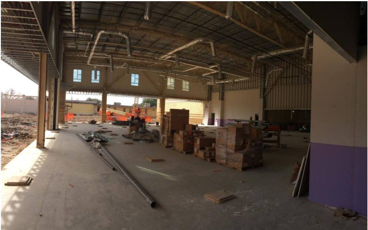
LIBRARY – On-going interior sheetrock work.

Project Name: New Seguin High School Arch/Engineer: ERO Architects Construction Program Manager: Broaddus & Associates Contractor: Bartlett Cocke/Koehler Current Phase: Construction Administration