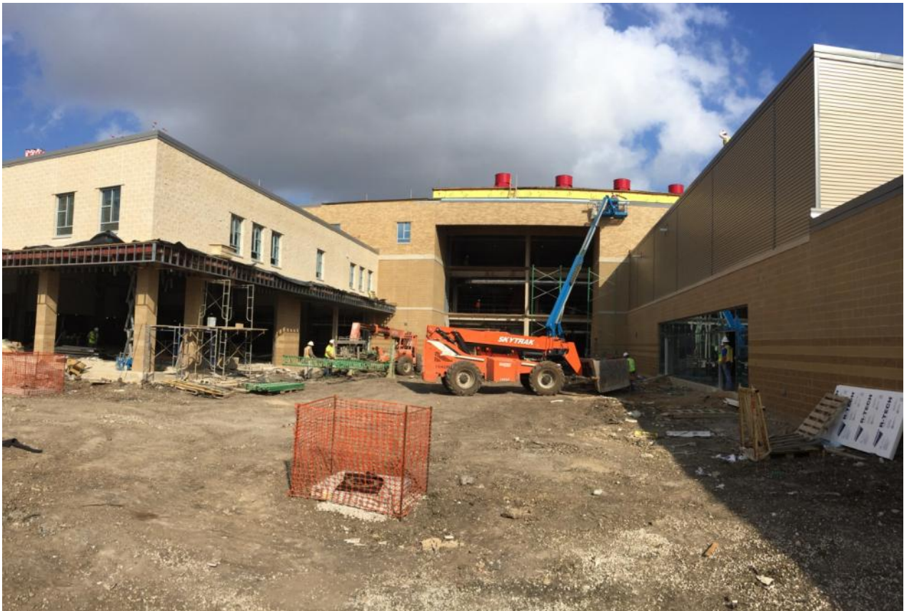
COURTYARD (SOUTH) - located between Library (on left) and Cafeteria (on right) On-going masonry work

Project Name: New Seguin High School Arch/Engineer: ERO Architects Construction Program Manager: Broaddus & Associates Contractor: Bartlett Cocke/Koehler Current Phase: Construction Administration