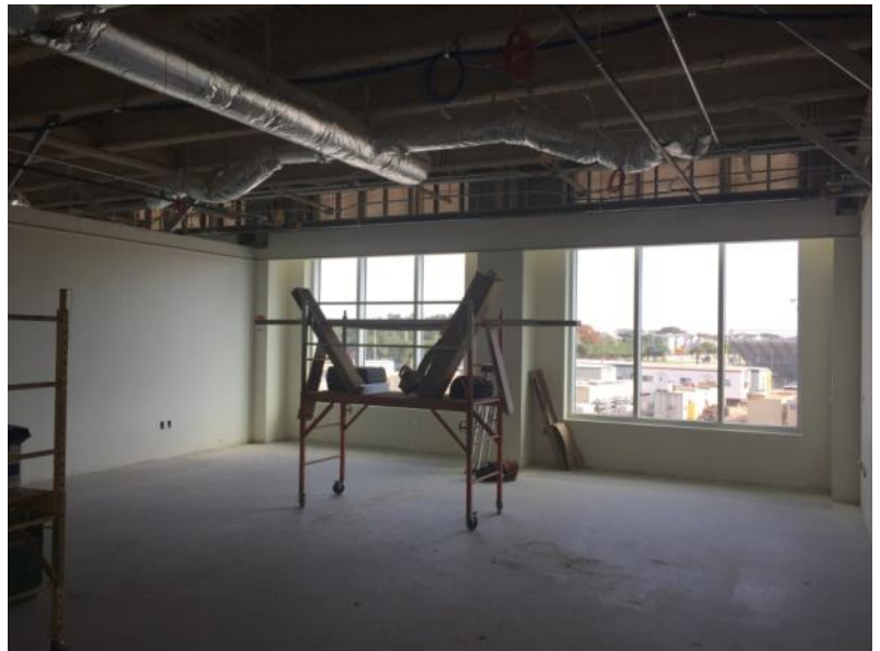
ADMINISTRATION AND CLASSROOMS – Painting of walls in atrium at the administration and classroom area (left photo). Painting of walls and installation of lay-in ceiling grid and light fixtures in a typical classroom (located along the east side of area C). (Left photo).