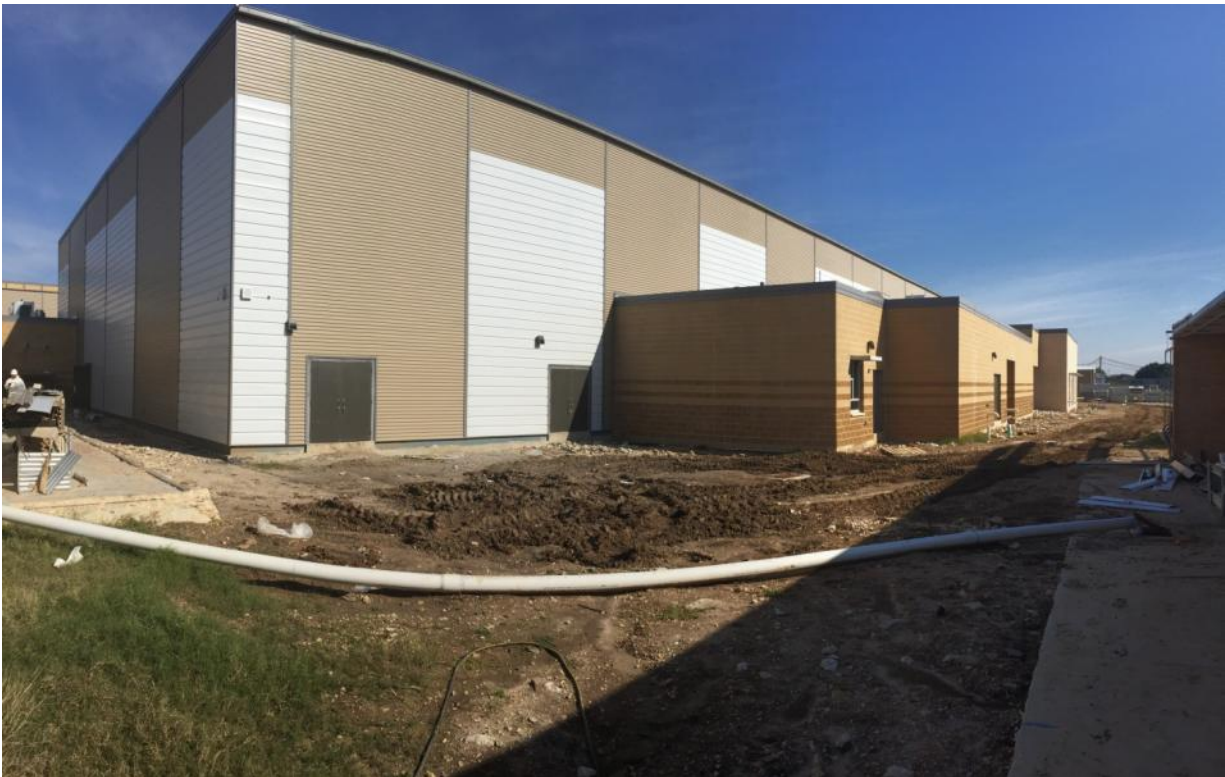
SOUTHWEST EXTERIOR VIEW OF GYMNASIUMS AND ATHLETIC LOBBY On-going miscellaneous site work.

BC-K reported that they received some rain activities, in the last week, but that it would not affect project schedule. The total rain event day's to-date still stands at 42 days of limited production, and 19 rain days of zero production. Project is at 70% completion, as of this week, and on target to meet original schedule.